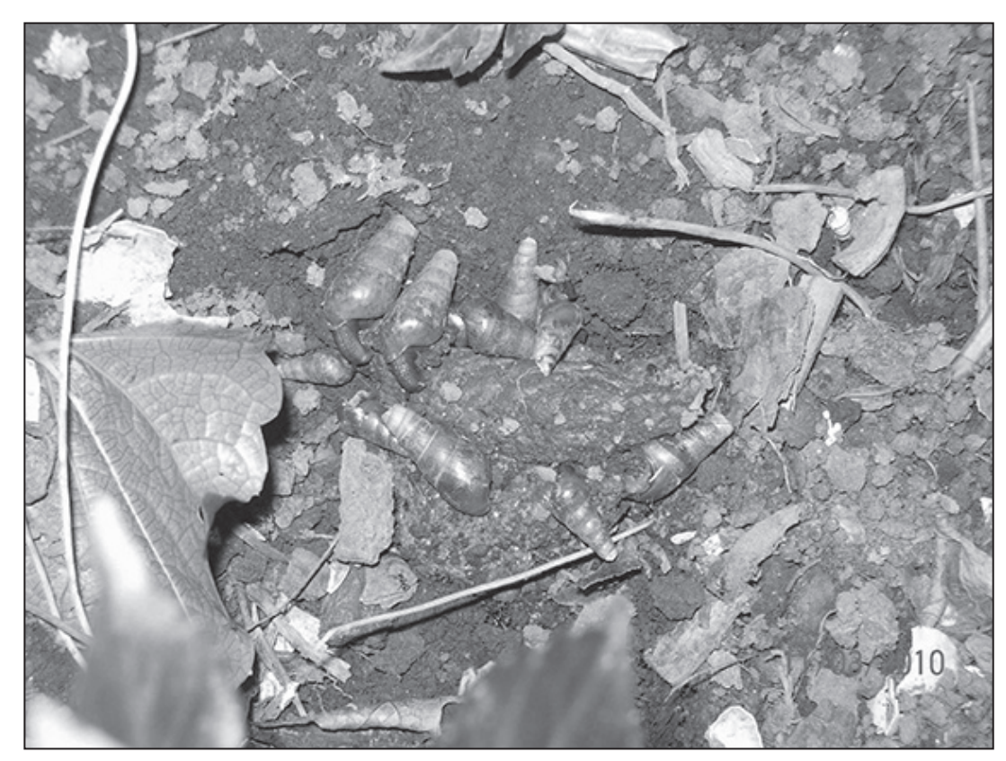
Fig. 2. Adult R. decollata snail feeding on faeces.