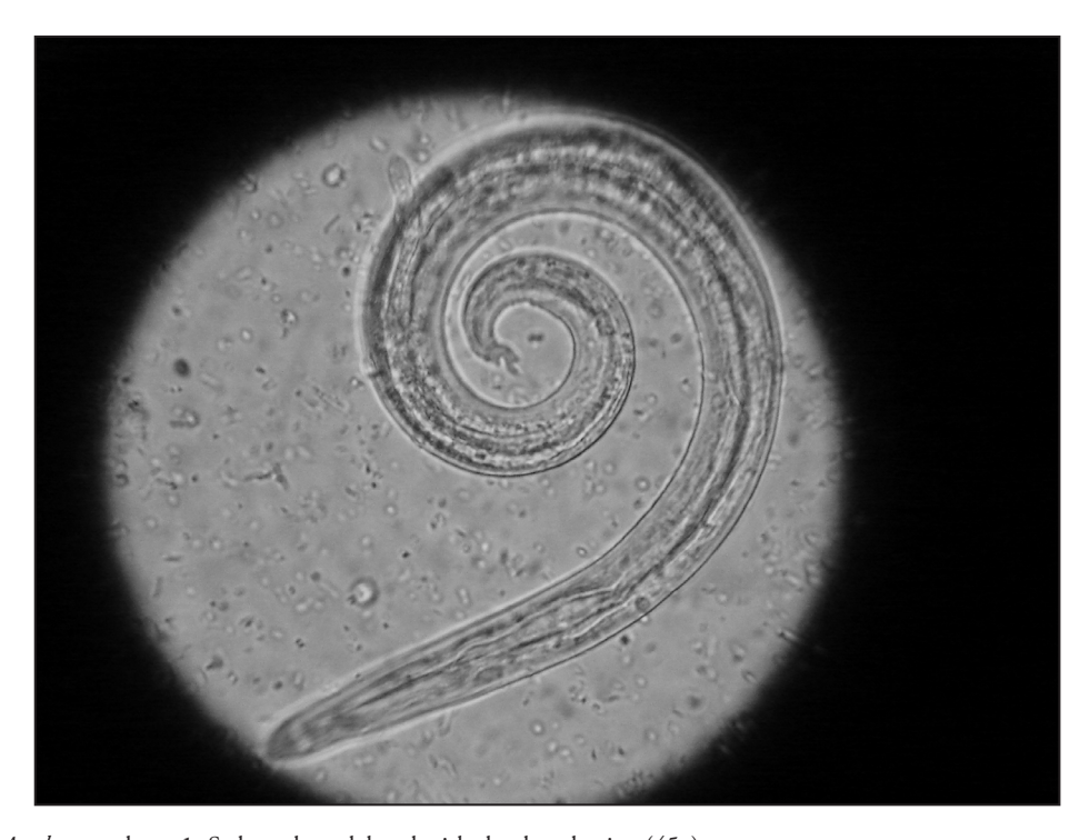
Fig. 1. A. abstrusus larva 1. S-shaped caudal end with the dorsal spine (45x).

Feral cats have structured defecations habits. They usually bury their faeces in sectored and community places and in wet surface areas around trees<sup>1, 29</sup>. In this study, we agree with the aforementioned authors regarding these cats' defecation habits since we found most of semiburied faeces in these kinds of places. The high proportion of feces positives for A. abstrusus (35.30%), confirms that the life cycle of the parasite takes place in the area. Most of snails were found feeding on buried faeces so coprophagus